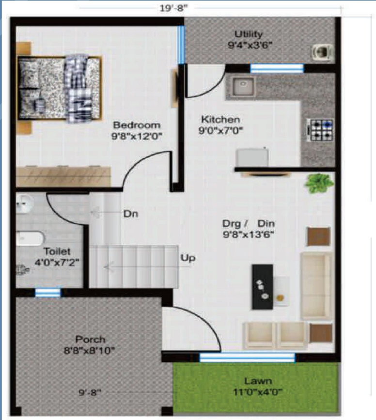
Ground Floor 510' sqft.